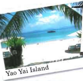
Yao Yai Island