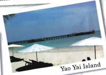
Yao Yai Island