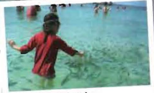
Khai Nok Island