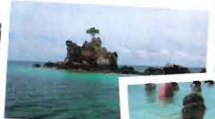
Khai Nui Island