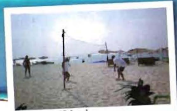
Khai Nai Island