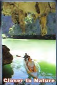
Closer to Nature