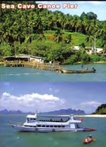
Sea Cave Canoe Pier