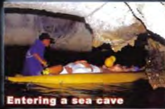
Entering a sea cave