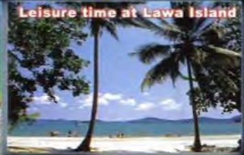
Leisure time at Lawa Island