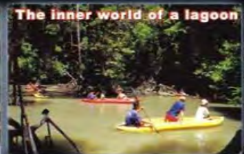
The inner world of a lagoon