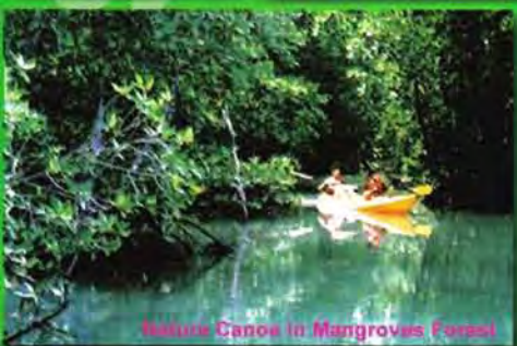
Nature Canoe in Mangroves Forest