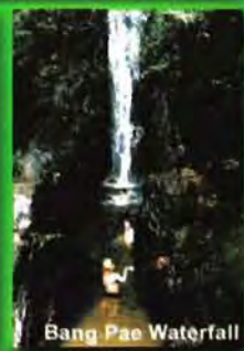
Bang Pae Waterfall