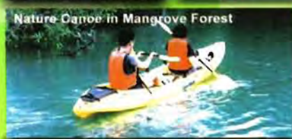
Nature Canoe in Mangrove Forest