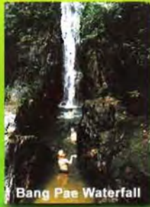
Bang Pae Waterfall