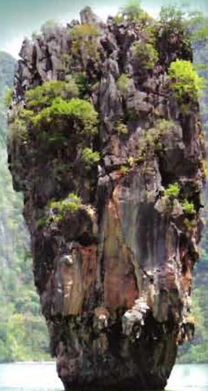
James Bond Island