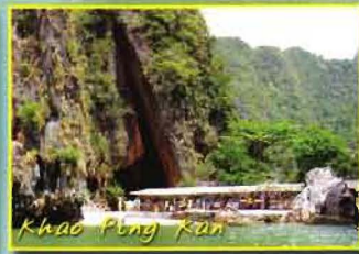
Khao Ping Kan

UNCE-UNDEED SPECIAL LUNCH & FEE. NATIONAL PARK