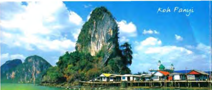
James Bond Island